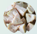
Jackfruit Green (whole)