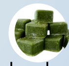
Spinach cube (Palak)

Sourcing: We source vegetables and fruits from Jharkhand and eastern states. They are special because they are available round the year , 100% natural and almost organic. They are sweeter in taste due to higher potassium content in the soil and natural ways of farming practices. Most of the crops are not genetically modified thus having natural longer shelf life and spoilage resistance.