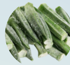
Okra / Ladies Finger