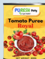
Tomato Puree Royal